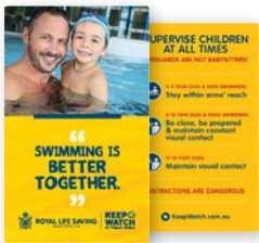
Lifeguard Information Card (TS528ACT)