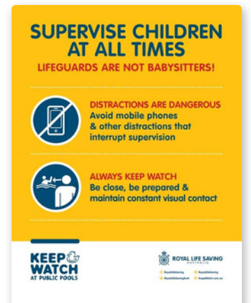
Concourse Sign - Mobile Phone (TS554)