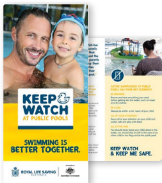
Information Brochure (TS510 – 250 units)