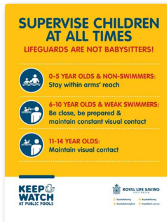
Concourse Sign – Rules (TS552ACT)