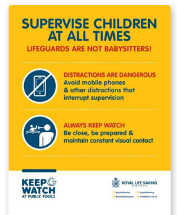
Concourse Sign - Mobile Phone (TS554)