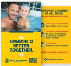
Lifeguard Information Card (TS528)