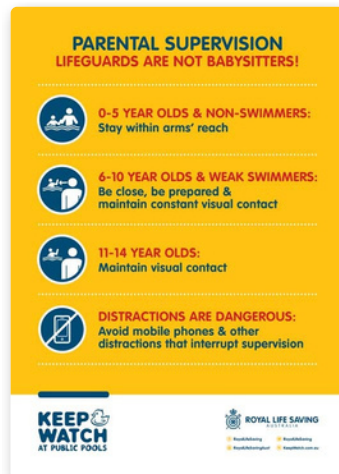
A1 Wall Sign (TS550)