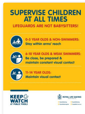
Concourse Sign – Rules (TS552)