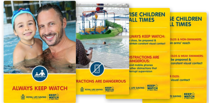
Bathroom Posters – A4 Variety 6 Pack (TS535ACT)