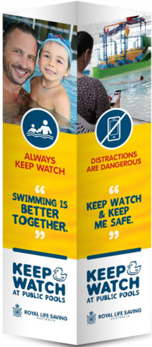
Bollard Signage 4-Sided (TS558)

WE SUPPORT KEEP WATCH AND PROMOTE ACTIVE SUPERVISION OF CHILDREN