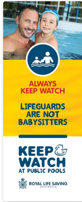
Pull Up Banner (TS501)