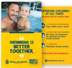
Lifeguard Information Card (TS528ACT)