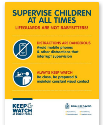
Concourse Sign - Mobile Phone (TS554)