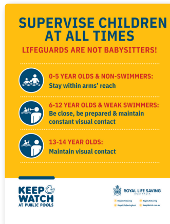
Concourse Sign – Rules (TS552ACT)