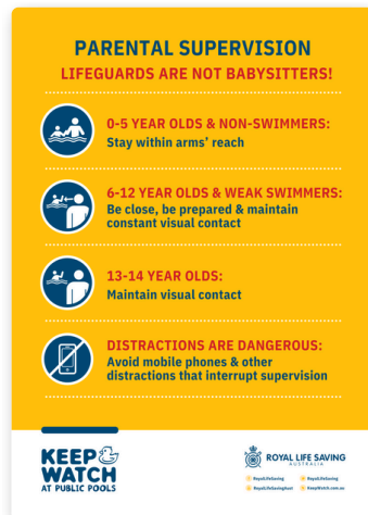
A1 Wall Sign (TS550ACT)